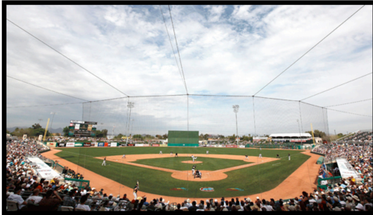
The Cubs have been at their current location in Mesa, Ariz., since 1979.